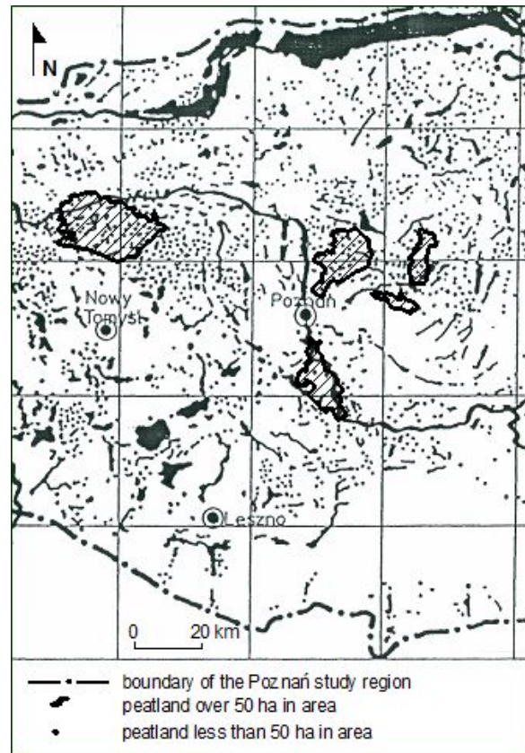
Fig. 2. Investigated landscape parks in the context of the peatlands map of the Poznań region

The location of landscape parks under investigation on a map of peatlands in the Poznań region [ILNICKI et al. 1996], covering a significant part of Wielkopolska and Lubusz regions, is shown in Figure 2. All the landscape parks under discussion are found