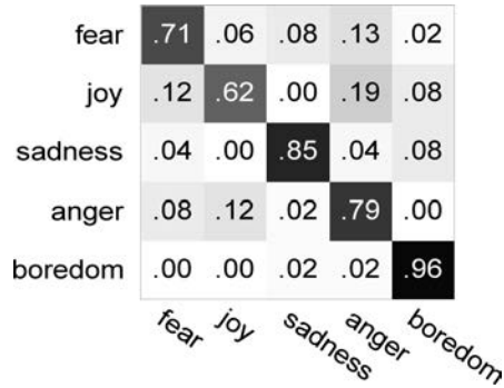
Fig. 2. Confusion matrix for the PLSR method.

To distinctly display the test results of different emotion category, the confusion matrices of PLSR method and SPLSR method are shown in Fig. 2 and Fig. 3, respectively. Moreover, we also implement the experiment of SPLSR method with different values of the sparse parameter. Table 2 shows the recognition rates of SPLSR method versus different values of the sparse parameter.