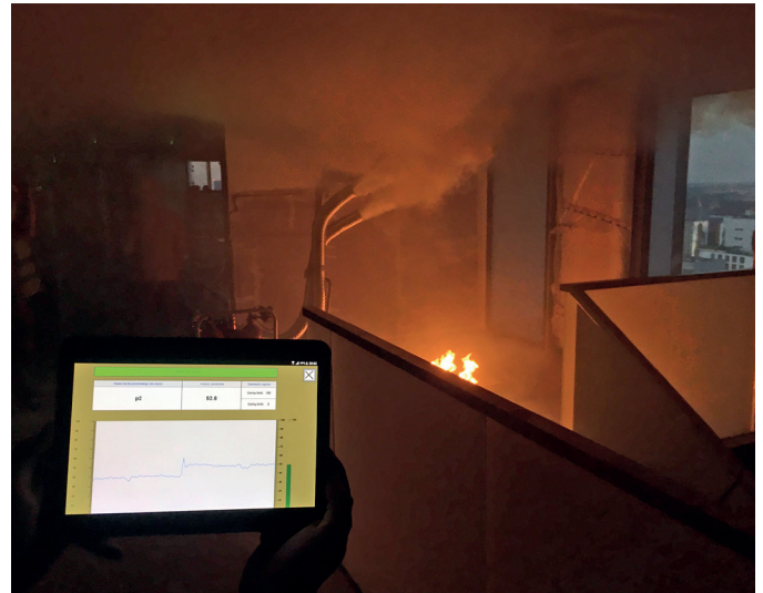
Fig. 5. Dynamic measurements of pressure differential system, combined with a hot smoke commissioning test in a high-rise building – a site acceptance testing method developed in Fire Testing Laboratory

against large-scale fire, which is a vital part of product development. As mentioned in chapter 4, in a highly rigid legislative framework, evolution of solutions and materials to meet higher rankings and requirements is the most basic form of progress in the construction industry. New advancements in materials, products and techniques heavily influence how buildings are designed and built. Besides the basic function as the evaluator, fire testing laboratories take part in market surveillance. In this process, products (e.g. fire doors, insulation materials) are purchased on the market, and then their characteristics are estimated. This process ensures that the products available on the market are the same, as they were tested during their approval and certification phase. A similar process is sometimes observed in the construction of critical infrastructure. Randomly chosen samples of products may be tested in a fire testing laboratory, before the whole batch of products is installed in the building.