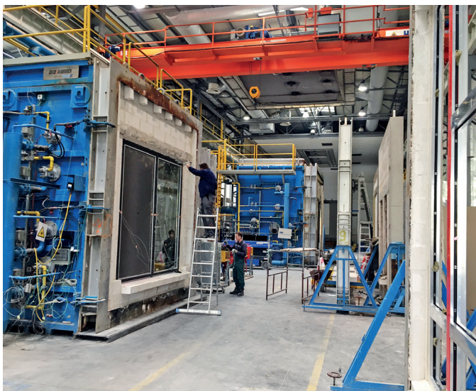
Fig. 4. Large furnaces hall in the Fire Testing Laboratory of Building Research Institute, Pionki

Accredited fire testing laboratories play a major part in the shaping of the development of civil engineering [85], Fig. 4. The most obvious role of the laboratory is in the initial product testing – a complex evaluation of whether the products or materials meet their requirements stated in prescriptive acts of law. This is an essential part of the certification of products, which in the end allows them to be used in construction. Such testing also allows the manufacturers to verify their solutions