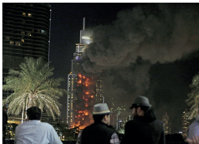
Fig. 2. The Address Hotel fire on 31.12.2015

Through the newest achievements of civil engineering, materials such as cross-laminated timber, wood processing by-products or recycled plastics are introduced into buildings. These combustible materials increase the risk of an external fire growth. Other challenges regarding the external fires arise with the popularity of solar panels built on the walls and roofs of buildings. Along with the sustainable energy sources, large domestic energy storage devices are introduced, usually in the form of large-scale Li-ion batteries which are also troublesome from the FSE point of view. If FSE cannot overcome these