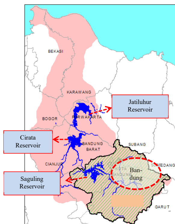
Fig. 1. The location of Saguling Reservoir and Citarum watershed; source: own elaboration

The study location is Saguling Reservoir in West Java Province, Indonesia. The reservoir acts as a trap for pollutants discharged into the Citarum River and around the residential area of Bandung. The location is illustrated in Figure 1.