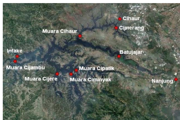
Fig. 2. The location of monitoring quality stations in Saguling Reservoir

The output of Saguling was monitored once per year from 1999 until 2013, and the water quality was observed regularly every three months [March, June, September, and December). There are 11 quality monitoring stations: Nanjung (input), Batujajar, Cipatik Muara, Muara Ciminyak, Cimerang, Tjihaur, Muara Cijere, Cijambu Muara, Muara Tjihaur, Turbine Intake, and Tailrace. A total of 44 water quality parameters which consist of physical and chemical parameters were monitored.