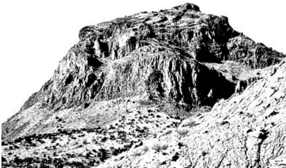
Text-fig. 1. D-Cross Mountain, elevation 2589 m, a Tertiary volcanic neck that stands approximately 91 m above Upper Cretaceous strata in northwest Socorro County, New Mexico, 90 km northwest of Socorro. The neck is elliptical in map view and approximately 460 m across. The “D” and “X” visible on top of the mountain formed naturally in cooling, basaltic lava. View is to the northwest. Modified by Little Hawk Studios, Magdalena, New Mexico, from Robinson (1981, pl. 22)

Bill did section this smaller specimen (Cobban and Hook 1981, fig. 9), but only after I assured him there were no more specimens in the area. The venter of this specimen (Text-fig. 2) is rounded to a diameter of 4.0 mm; at 5.8 mm it is slightly flattened and at 9.2 mm it is well flattened. At diameters of 14.8 and 24.5 mm, the venter is sulcate. The venter is flat at 41.0 mm and narrowly rounded at 69.5 mm. The specimen is, indeed, a Hoplitoides and was referred to H. wohltmanni (von Koenen, 1898). Our biostratigraphy had survived its first test.