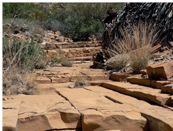
Text-fig. 3. Outcrop photograph of the upper portion of the flag member of the Colorado Formation, Cookes Range, New Mexico, looking north. The orange-weathering, 10 cm-thick flint clay in the center background is one of 31 flint clays interbedded with thin limestones in the flag member. Marine fossils collected from the flag member are from the late Cenomanian

During our discussion of the land-living octopus depicted on the postcard, Bill and I recalled an ongoing, tongue-in-cheek conversation we had had since 1977 about depicting the ammonites from the Colorado Formation in the Cookes Range as land-living creatures, happily swinging from trees. The basal 11 m-thick flag member of the Colorado Formation in the Cookes Range contains a late Cenomanian Calycoceras canitaurinum assemblage zone fauna and is interbedded with 31 flint clays ranging in thickness from a few mm to 10 cm (Text-fig. 3). These flint clays are hard, dense, yellow or orange claystones that break with a conchoidal fracture. Compositionally, they are almost entirely kaolinite. Conventional wisdom has it that flint clays form only in acidic (i.e., nonmarine) environments; they are especially common as underclays for coal deposits. Hence, the hypothetical paleo-environment in which the ammonites swing through the trees.