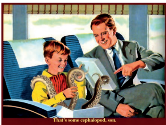
Text-fig. 2. Scan of the postcard “That’s some cephalopod, son,” copyright 2000 by Ken Brown Cards, 12 Harrison Street, NY, NY 10013. Used by permission

weird and unrealistic. After all, an octopus could not live for long out of water.