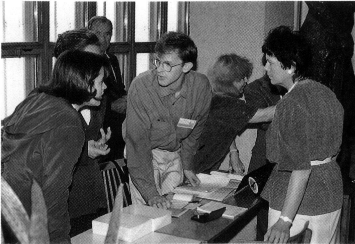
Fig. 4. At the registration desk of the Symposium