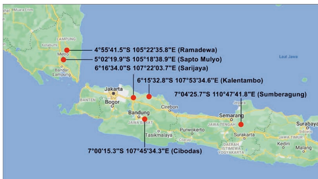
Fig. 1. Map of sample locations of Monochoria vaginalis

The material used was M. vaginalis weed from low-land rice plantations with high frequency of herbicide use (Fig. 1). The weed M. vaginalis originated from Sapto Mulyo village, Kota Gajah District, Central Lampung Regency, Lampung Province (5°02'19.9"S, 105°18'38.9"E), Ramadewa village, Seputi Raman District, Central Lampung Regency, Lampung Province (4°55'41.5"S, 105°22'35.8"E), Sarijaya village Majalaya District, Karawang Regency, West Java province (6°16'34.0"S, 107°22'03.7"E), and Kalentambo village, District of Pusakegara, Subang Regency, West Java Province (6°15'32.8"S, 107°53'34.6"E). The susceptible