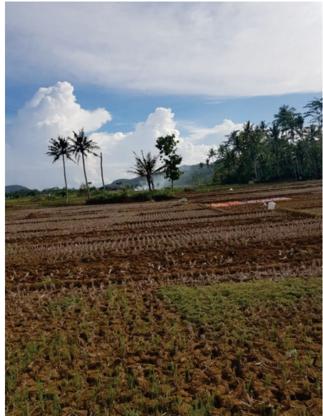
Photo 1. Extreme drought in East Sumba, East Nusa Tenggara Province

In the first 19 years of El Niño, the phenomenon occurred six times, while in the following 19 years seven times. One of these El Niño years still has a high rainfall value and it is classified as a weak El Niño. The results of this research show that the annual rainfall in the first six El Niño events is higher than the last six times. The research found that there was an accumulative decrease in total rainfall in the count of El Niño events, especially in the East Sumba region. The years 2002–2003 showed a higher rainfall value than other El Niño years. This could happen because El Niño these years was classified as weak with no ONI value greater than 1.5. Besides, El Niño began in mid-2002 and ended in early 2003, namely February, March, and April, whereas, other El Niño years generally occurred until the middle of the month or even the end of the month. Therefore, the rainfall in 2002–2003 reached more than 1000 mm.