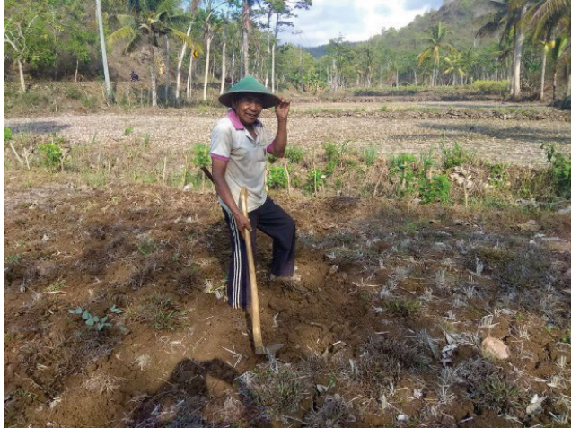
Photo 2. The impact of dry days in that year is in the long rain-free day in East Nusa Tenggara

the opposite. In July to December, there is an indication that La Niña phenomenon is weak, as shown by an increased number of days without rain. The ONI value is less than negative 0.5, which indicates that La Niña occurred in these months. Therefore, the series of dry days in that year was in the long rain-free day category and its impact is shown in Photo 2.