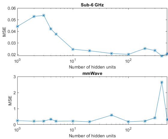
Fig. 2. The MSE for various number of LSTM hidden layers; network is same as for 1 and; features - mmWave: 5, features - sub-6 GHz: 10.

The MSE decreases when the number of hidden units grows over three (Fig. 2, top). The best result is achieved for 400 hidden units (0.0189). The MSE for one hidden unit is 0.0441. The second achieved result is for 100 hidden units (0.0202). It shall be considered that the training time increases while increasing the number of hidden units and the maximum is set to 500.