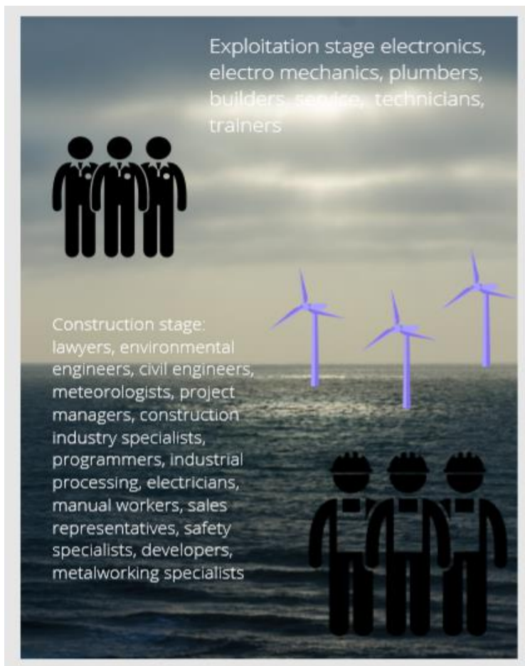
Fig. 2. Possible jobs in the wind sector with division into construction and exploration stages