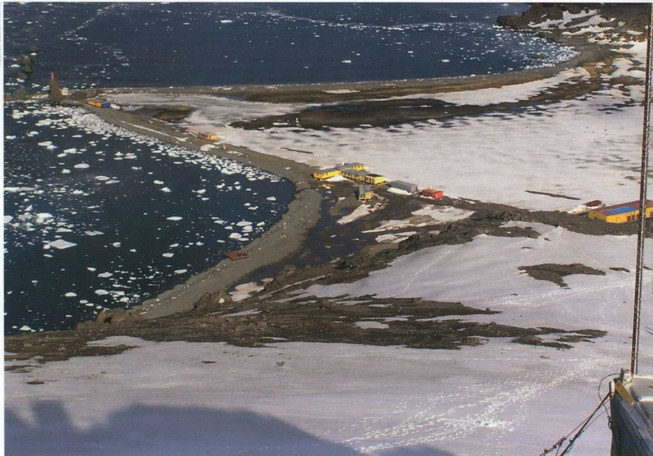
A birds-eye view of the Arctowski Research Station, which was founded in 1977 on the coast of Admiralty Bay, on King George Island