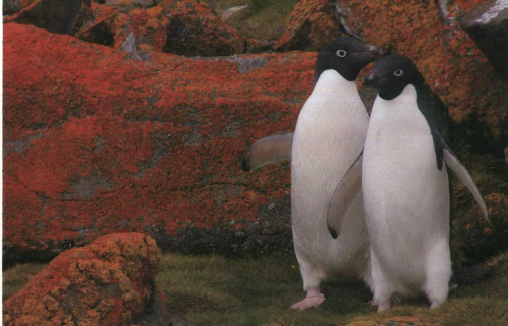
Adelié penguins against a backdrop of lichens: Antarctica can be a colorful place!