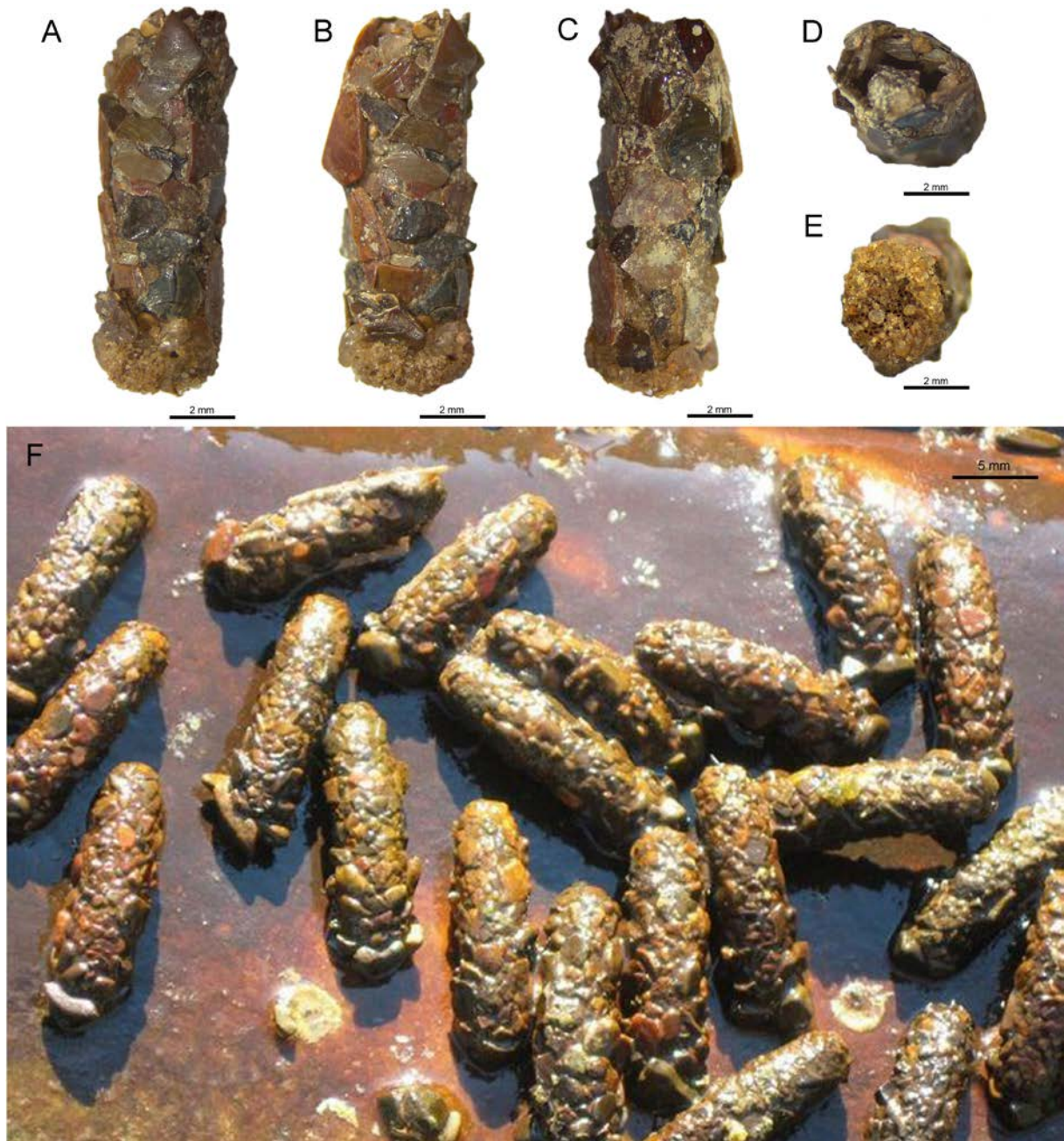
Text-fig. 2. Cryptosiphon oboloides sp. nov. from the Furongian Tsitre Formation of Turjekelder, northern Estonia (holotype, TUG 1209-100) in different lateral views (A–C) and showing tube endings (D, E). F – cases of modern caddisfly larvae.

outer surface of the silken tube (Wiggins 2015). We infer a similar building strategy for our agglutinated tube. It originally contained an organic inner lining with a sticky external surface on which the shell fragments and sand grains were glued. The relatively well-arranged grains in the tube wall suggest that the animal actively assisted in gluing the shell fragments, orienting, and finding the right place for them.