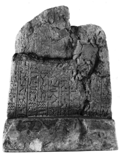
Fig. 1. Stela MNP A 886 (recto and verso), courtesy of National Museum in Poznań