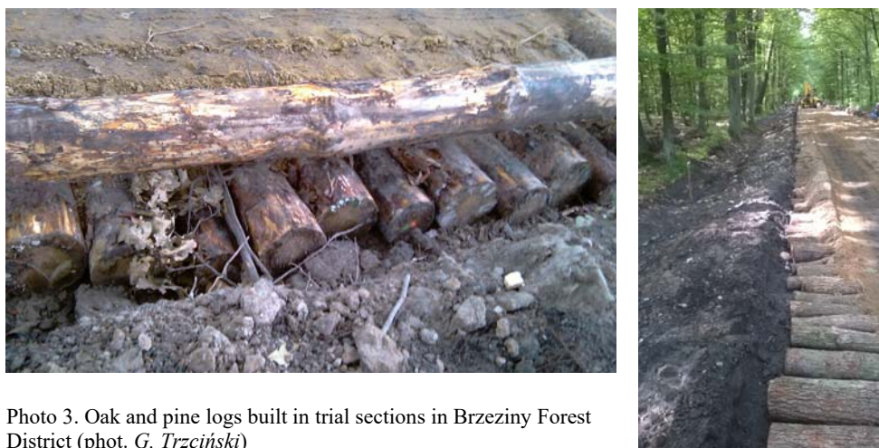
Photo 3. Oak and pine logs built in trial sections in Brzeziny Forest District