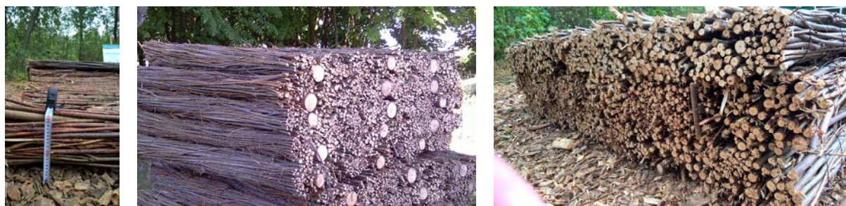
Photo 2. Willow brushwood mattress with and without logs reinforcements built in trial sections of Brzeziny Forest District

mat) using different aggregates (Photos 2 and 3). Different timber logs and aggregates were used to investigate the impact on road parameters and technological and economic aspects (wood price and biodegradation).