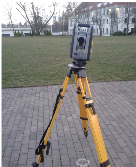
Fig. 3. Oblique tachymeter during surveying

the errors, does not affect the reduction of the accuracy. It was finally stated that the developed TFS transformation method is useful for surveying. Thus, it is possible that performing the measurements with the oblique instrument set in an unknown place (with the compensator switched off) has no influence on the accuracy of the transformed coordinates. For the TFS transformation four adjust points are obligatory. They must be known in both coordinate systems. One of them is necessary for calculating the virtual translation, while the other three points are useful for calculating the rotation matrix. The use of modified calculations (by the virtual translation), used in photogrammetry for surveying, fulfilled the task. Additionally, in this case the method was useful also for high rotation angles what is not so often using in photogrammetric transformations. According to the authors, the method may be found useful for local, precise surveying as well as for other geodynamic and engineering purposes, especially in non-stable places (e.g. on floating vessels) where levelling of an instrument may not be possible.