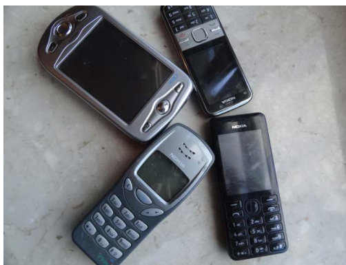
Fig. 2. Spent mobile phones hidden in a drawer of one of authors

inefficiency, but because of their replacement by new and better devices. As they are really small devices, they are very often stored or even disposed of with household waste (Buchert et al. 2012). It is very common that each person using mobile phones has 2, 3 or even more older devices “hidden in a drawer” (Fig. 2). This is why the mobile phone end-of-life recycling rates are still extremely low, commonly only several %, while for other, larger WEEEs (e.g. PCs, laptops) these rates are much better. So, spent (end-of-life) mobile phones are very important, but still mostly unused, a secondary source of many metals. The potential of metal recovery from spent mobile phones (SMPs) and their conditions are analyzed in the paper.