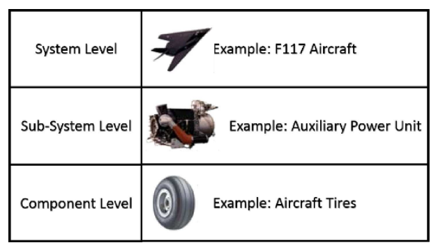
Fig. 2. Different levels of PBL contract [23, 24].

PBL can be made in many different levels. Picture two is showing three examples of that. PBL can contain system level at the widest. At this point were talking about the whole aircraft as a unit. Subsystem level comprises of a group of smaller systems, such as a motor, that finally compile a complete system, an aircraft. Smaller PBL contracts can be built on component level. This includes single components, component families or spare parts for different maintenance programs. Case organizations in this study are building their PBL capabilities at component level and sub-system level. It can be said that system level PBL requires a lot of extensive and time-consuming learning and development before actual PBL contract can be established.