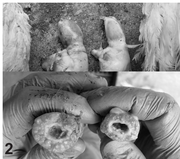
Fig. 2. Six week old broiler chickens from the flock diagnosed with TVP. Affected proventriculi (left) is enlarged (top) with thickened wall (bottom; cross section of proventriculus cut in the middle of the organ in comparison to non-affected one (right)).