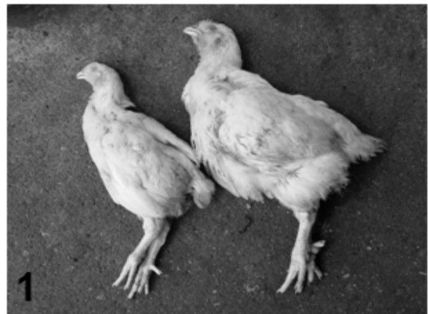
Fig. 1. Six week old broiler chickens from the flock diagnosed with TVP. Clinical TVP (broiler on the left) does not affect 100% of birds in the flock. Uneven growth, causing poor uniformity is usually the first sign of TVP.

weight gains, reduced uniformity of birds (well pronounced in older birds) and slightly increased death rate concerning mainly weaker and smaller birds (Fig. 1). Overall, the disease occurred in approximately 55% of the birds, and the mortality did not exceed standard values for broiler chicken production (below 5%). The necropsy revealed characteristic enlargement of the proventriculus outline with thickening of the walls (Fig. 2). In its lumen, macroscopic analysis demonstrated a small amount of mucus. In single cases, hemorrhages were also noted in proventriculi mucosa.