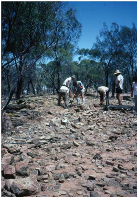
Text-fig. 1. 4 th symposium: Upper Devonian Mandagery Sandstone locality near Canowindra, New South Wales, Australia