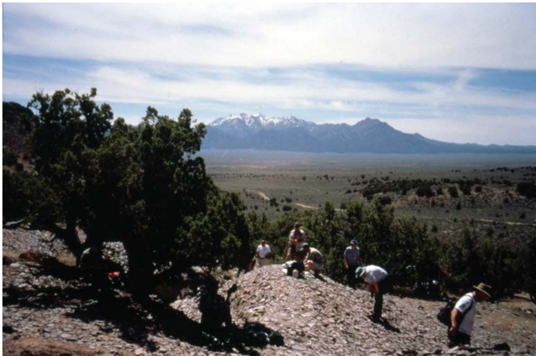
Text-fig. 5. 9 th symposium: participants of the excursion at the upper Middle Devonian locality Red Hill, Northern Simpson Park Range, north-west of Eureka, Nevada, U.S.A. (Roberts Mountain in the back ground;)

series. At this symposium, all the participants were accommodated in one location, the European Centre for Geological Education, a new building complex in a former quarry where the oral and poster presentations were delivered.