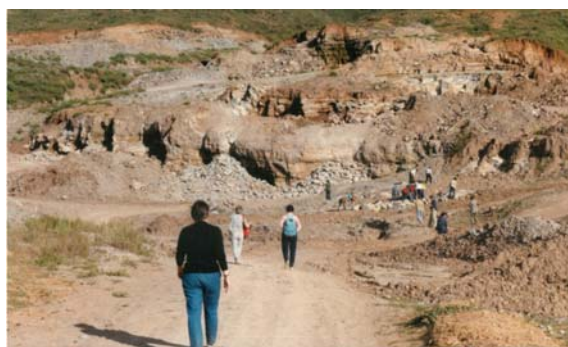
Text-fig. 2. 5 th symposium: Middle Devonian locality with rich osteolepid fauna, cement quarry near Shuinichang, Yunnan, China