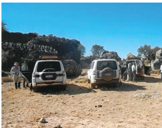
Text-fig. 6. 13 th symposium: Pre-meeting excursion at the original Gogo camp site at a Upper Devonian reef complex, Gogo Station, near Fitzroy Crossing, Western Australia

The three largest symposia in the last 50 years