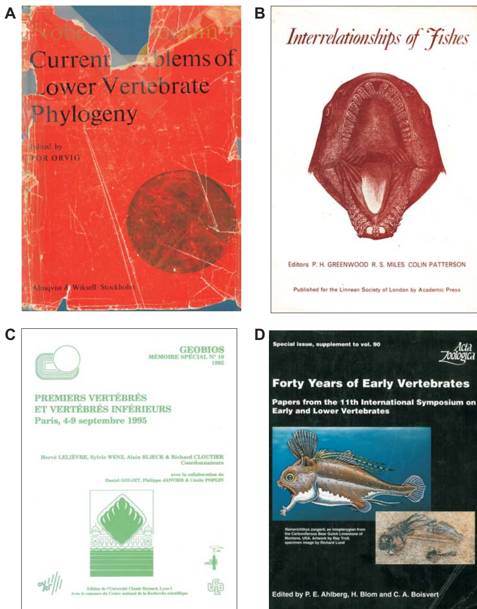
Text-fig. 7. Cover of proceedings: A – 1 st symposium; B – 2 nd symposium; C – 8 th symposium; D – 11 th symposium

Thus, the papers in the proceedings of the 6 th symposium (Mark-Kurik 1992) are arranged under the headings Palaeoecology, Function, Morphology, Ontogeny and Relationships and Environment. The contributions were relatively short, and none dealt with the subject extensively.