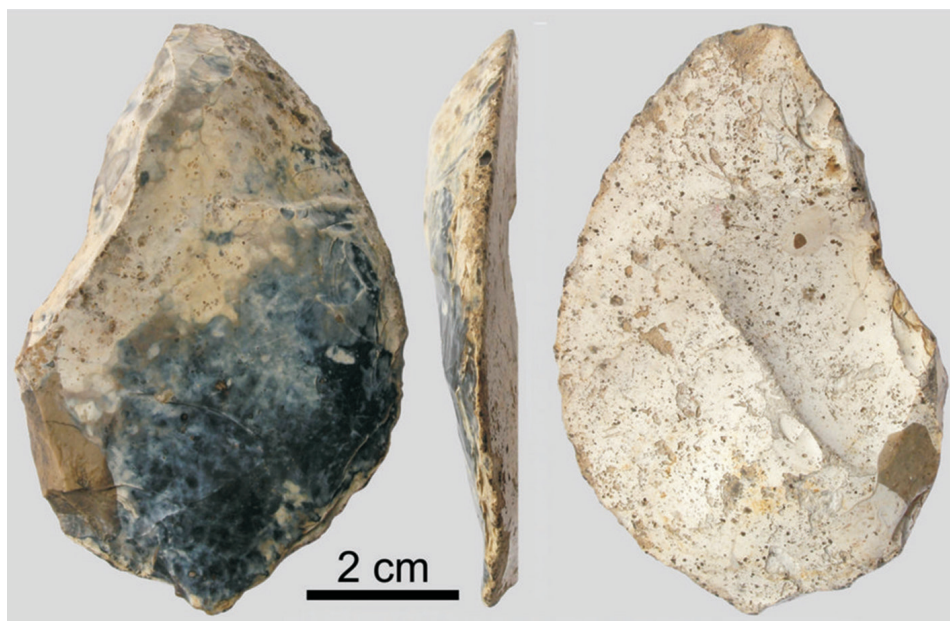
Fig. 2. Hillfort Starý Zámek near Jevišovice. Sidescraper. Middle Paleolithic; After Šebela, Přichystal, Škrdla, Humpolová et al. (2015)

Petrographic examination under a stereomicroscope in water immersion has not revealed evident characteristic elements. Red pigment and sharp-edged petrosilex are typical for Jurassic silicites from the Cracow-Częstochowa Upland.