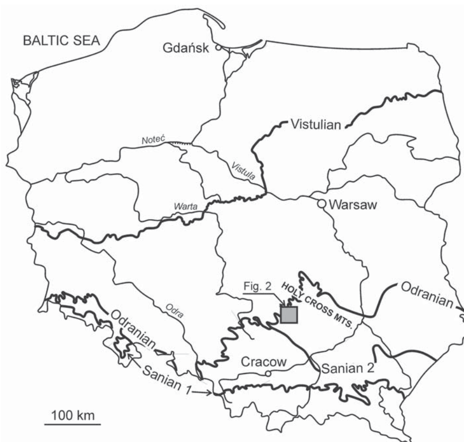
Fig. 1. Location of the study area in the western part of the Holy Cross Mountains in relation to extents of the Sanian 1, Sanian 2, Odranian and Vistulian glaciations in Poland.

The main goal of research was to build a coherent and comprehensive model of the Quaternary deposits in the western part of the Holy Cross Mts, in strict reference to the current scheme of the Polish Quaternary stratigraphy. This model can be useful for regional correlation of Quaternary deposits, which is very important to order steadily increasing amount of geological data from the Holy Cross Mts.