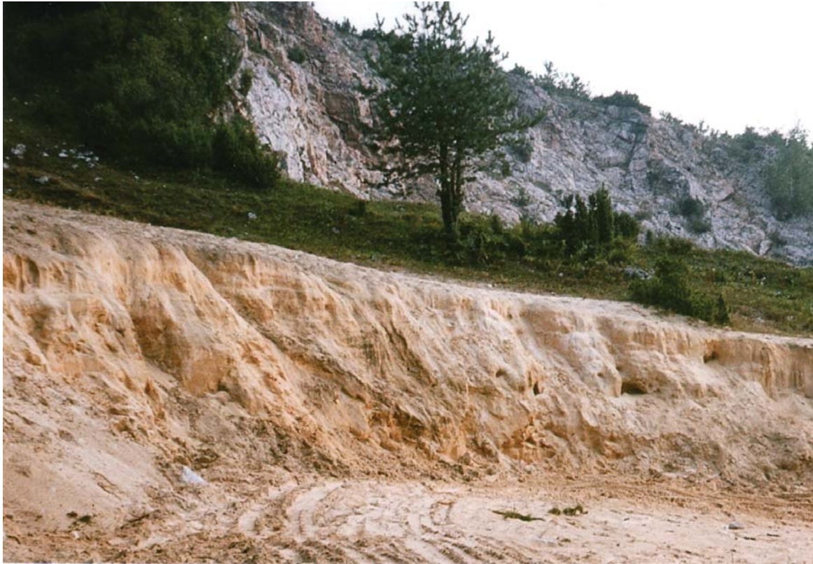
Fig. 4. Kame sands on the western slope of Miedzianka Hill.