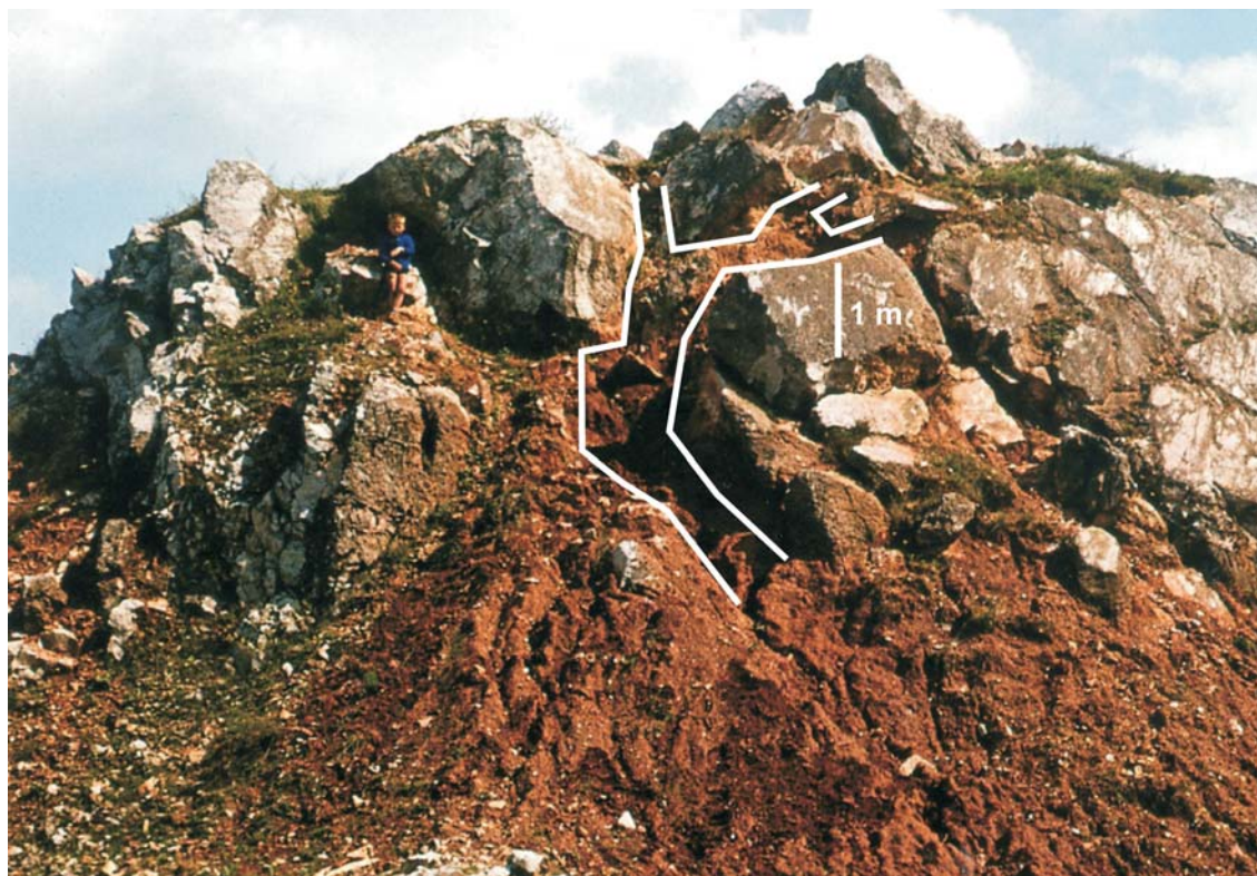
Fig. 3. Site Kozi Grzbiet with the Podlasie Interglacial deposits (phot. L. Lindner, 1972).