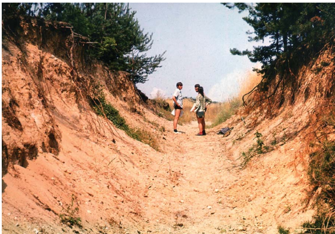
Fig. 5. Road cut across a fissure feature (esker) at Radkowice.

time located beyond the maximum extent of the ice-sheet (see Marks et al. , 2016). Rhythmically bedded sand and silt, up to 4 m thick in the lower part of the sequence (Figs 2, 3), overlies the laterally exposed glacial till of the Sanian 2 Glaciation and is incised by an ice wedge, 2 m deep, that may be correlated with periglacial climatic conditions during the Liwiecian Interglacial. A cross-section of the Sufraganiec valley proves that these deposits are underlain by fluvial series of the Mazovian Interglacial (Giżejowski and Lindner, 1977). It may be assumed that these deposits represent fluvial accumulation in low-energy conditions and very good sorting (Dzierżek et al. , 2019). Similar deposits were noted also in the lower catchment of the Wierna River, where they are about 20 m thick and overlie fluvial deposits of the Mazovian Interglacial (Lindner, 1977a). Further to the west, they were noted in the western margin of the Holy Cross Mountains, where they were TL-dated at 388 ka BP in the Czarna Sulejowska catchment (Lindner and Marciniak, 2008).