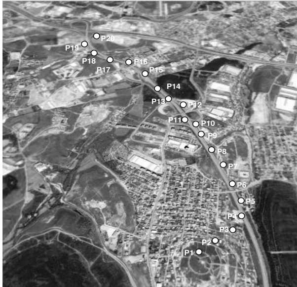
Fig. 3. The distribution of the test points in the project area