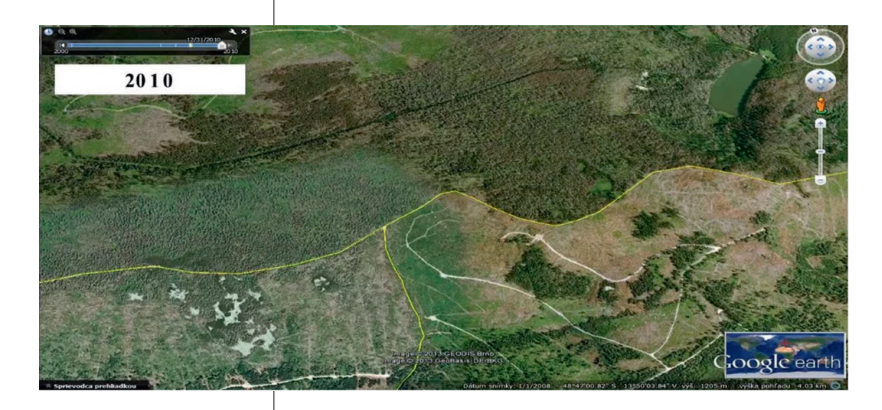
Fig. 1. Part of a bark-beetle outbreak underway at the confluence of three borders (Czech Republic, Germany, Austria) in 2010.

For this reason, a new zonation regime was created and imposed in 1995, this time based on many small core zones, which were very small and fragmented. Again, in the core zones there was no management, whereas buffer zone there was management.