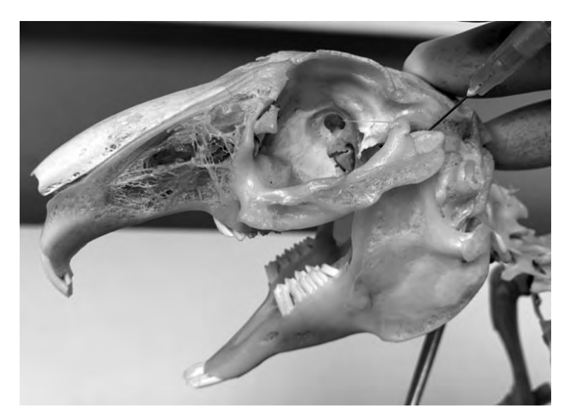
Fig 2. Location of the needle in the temporomandibular joint at a 45° angle and a depth of 10 mm.

The mandible was manipulated by opening and closing, producing a pendulum movement of the needle which accompanied the mandibular movement. Then the second needle of equal dimensions was then introduced, one millimeter behind the first to the same depth. In order to ensure the location of the needles inside the TMJ, the manipulation maneuver was repeated, creating a synchronous pendulum movement between the two needles. In the cases where this did not occur, the needles had to be redirected to enable a successful technique.