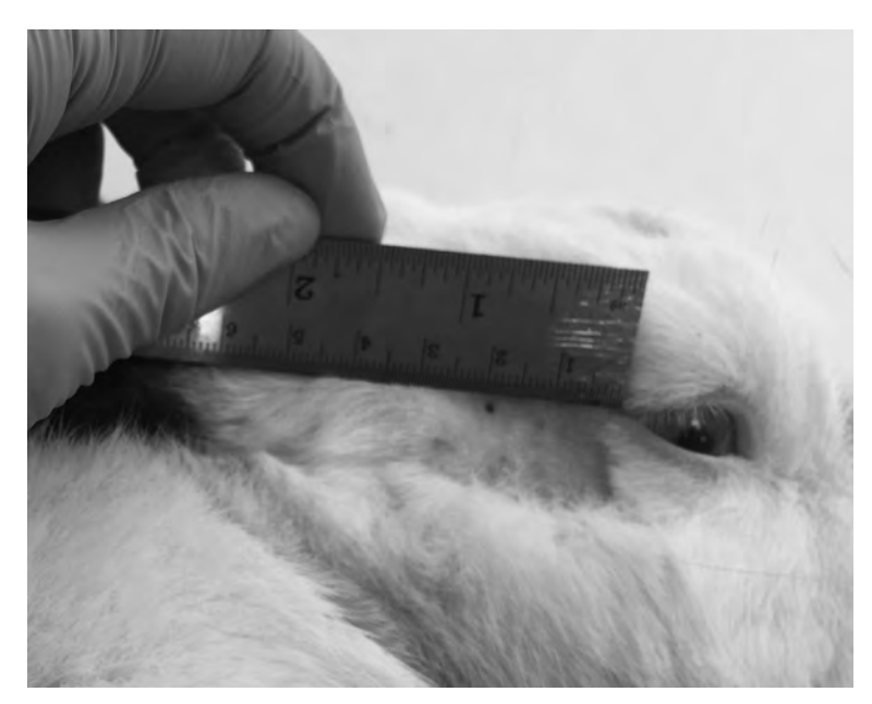
Fig 1. Measurement of the distance between the lateral part of the rima palpebrarum and the temporomandibular joint using a metal millimeter ruler.