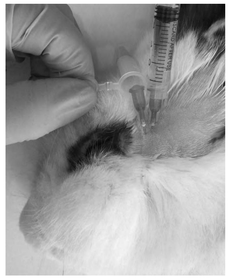
Fig 3. Positioning of the needles and passage of the fluid through the rabbit's temporomandibular joint.