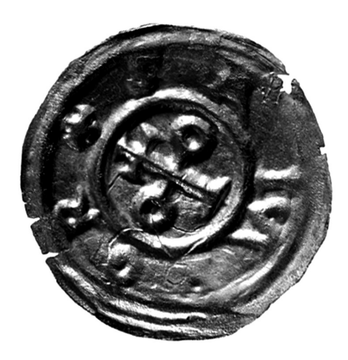
Fig. 32. Traces of a previous die impression over the bracteate No. 17 from the Tartaczna I hoard, Gdańsk; scale 3:1.