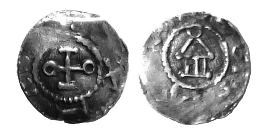
Fig. 29. Swabia, King Otto III, pfennig, Constance mint, 983–996; found at Zakroczym, Nowy-Dwór-Mazowiecki powiat, scale c. 1.5:1. Private collection.

formed in accordance with the Byzantine standards at the close of the eighth century, yet it kept appearing in the following centuries on French and Lotharingian coins due to the immobilization of dies, characteristic for this region (caused by political transformations.<sup>30</sup> In addition, monograms of other rulers, especially the kings of France, were patterned on it. The monogram of Otto did not undergo such a process, but other immobilized forms of the inscription of the name Otto appear throughout several decades on German coins, and on Italian ones even to the very thirteenth century, as grounds for the coinage rights of a state. The only thing that differentiates the monogram on the Pomeranian coin from the one used in Constance is that the upper part took the shape of a cross, yet the form of the letter T remained. Monograms of the cities of Zurich (TV RE CV' DC') and Breisach (PRISACHA) were constructed in a similar manner and appeared on coins in the second quarter of the tenth century, parallel with the monogram of Otto.<sup>31</sup>