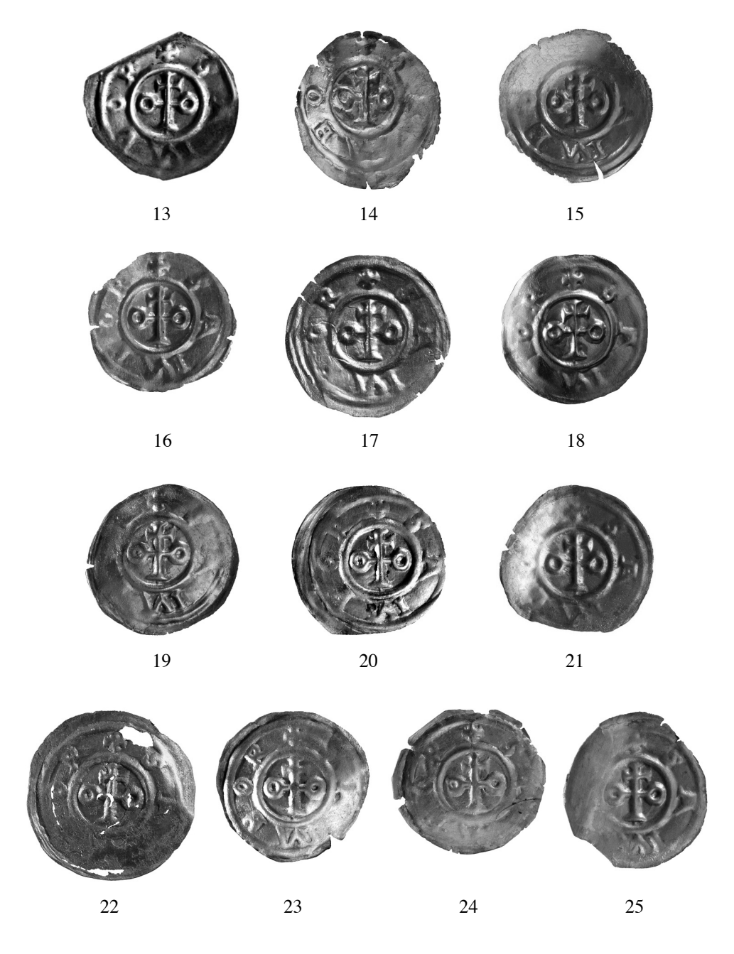
Figs. 13–25. Coins from the Tartaczna I hoard; the numbers correspond to the list, scale 1.5:1. Museum of Archaeology, Gdańsk.