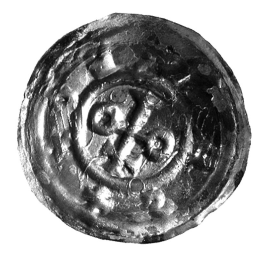
Fig. 31. Traces of a previous die impression over bracteate No. 11 from the Tartaczna I hoard, Gdańsk; scale 3:1.

Are the newly-found bracteates the first coins of Sambor I? Probably not, although his name appears exclusively on these. On eight of the coins found on Tartaczna Street there are traces of cold restriking from other bracteates (Figs. 31–33). The phenomenon of striking bracteates on older coins without re-melting them was rather common, but is hardly noted in any publications as it is hard to recognize.<sup>58</sup> It was connected with renovatio monetae – the coinage system that resulted in the bracteate form of money. It required the instant restriking of all the coins circulating in a certain district to new ones, and the coinage profit was not necessarily made on the change of the rate of mintage, but rather on the non-equivalent relation of the exchange.<sup>59</sup> In this situation, restriking an old coin with a new die saved time, silver (every re-melting causes losses) and labour. Of course, there is no rule saying that it was always the previous issue of bracteates restruck in the same district, but it is the most probable situation.