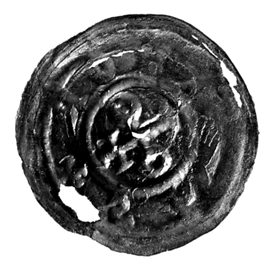
Fig. 33. Traces of a previous die impression over the bracteate No. 22 from the Tartaczna I hoard, Gdańsk; scale 3:1.

of Sambor's, since it is possible that he had begun his coinage with the OTTO monogram type, so it requires further research.