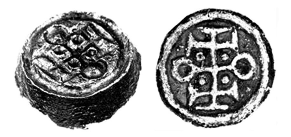
Fig. 27. The bracteate die found in Gdańsk at the Olejarna site, and its impression, scale c .1.5:1. Museum of Archaeology, Gdańsk; after B. Kościński.

die dates back to the middle of the thirteenth century and the bracteates with a cross on a chevron to 1275–1295 according to stratigraphical findings,<sup>27</sup> (it might actually mean that they are in fact a little earlier), Sambor's bracteates, as we can see, came into existence before 1207. Therefore, given the new time frame, we need to look into the motif of a cross with annulets, unexplained to-date.