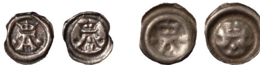
Fig. 15a and 15b. Forgery and original bracteate from King Sten Sture the Elder (1470–97 and 1501–03). Forgery: 12 mm and 0.09 g. Original: 14 mm and 0.22 g.