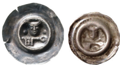
Fig. 5a and 5b. Forgery and original bracteate from Bremen, Bishop Hildbold von Wunstorf, 1258–73. Catalogue: Leschhorn 6558, Kestner 67. Forgery: 23 mm and 0.39 g. Original: 19 mm and 0.57 g.