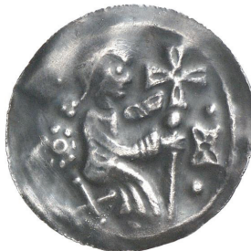
Fig. 2. Bracteate from Nordhausen c. 1130–1140 struck with a positive die from the reverse. 24 mm and 0.94 g.

Another reason to that bracteates are counterfeited relatively seldom is the low prices of bracteates on the collector market. Most medieval bracteates are anonymous and without legends and are thereby difficult to classify. Skilled knowledge is required to collect them, which presses the prices downwards. Therefore, counterfeiters have limited economic incentives to concentrate on bracteates. Instead, the focus is more often on more valuable coins from antiquity or the period 1500–1800.