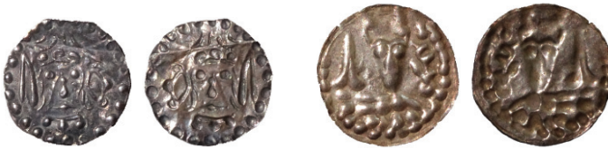
Fig. 13a and 13b. Forgery and original bracteate from King Canute I (1167–96). Forgery: 16 mm and 0.12 g. Original: 18 mm and 0.37 g.