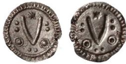
Fig. 12. Imaginary bracteate (V) from the eighteenth or nineteenth century. 14 mm and 0.27 g.