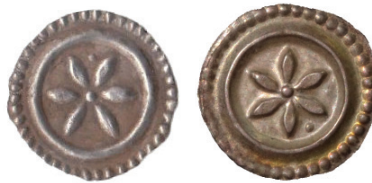
Fig. 21a and 21b. Forgery and original bracteate from Markdorf, anonymous counts, c. 1250. Catalogue: CC 254. Forgery: Unknown diameter and weight. Original: 20 mm and 0.38 g.

Finally, there are a final criterion used to identify bracteate forgeries. The forgeries often have empty fields or areas in the background that are not utilized (Figs. 18, 20 and 21). Since medieval bracteates were strongly linked to periodic recoinage (at least until c. 1300), it was necessary to change the design of the bracteates between issues. 6 The mint masters and die cutters then needed to utilize the whole miniscule area of the bracteates, displaying a plenitude of different symbols and details, so people could see the difference between valid and invalid issues. One conclusion that can be drawn is that modern counterfeiters do not know that bracteates were linked to renovatio monetae .