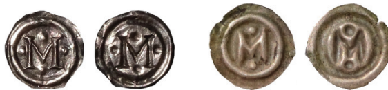
Fig. 14a and 14b. Forgery and original bracteate from King Magnus III Barnlock (1275–90). Forgery: 13 mm and 0.07 g. Original: 14 mm and 0.10 g.