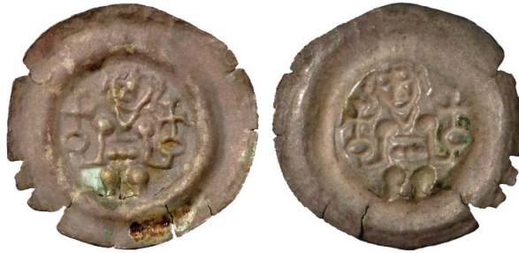
Fig. 4. Contemporary bracteate forgery with very low silver fineness struck by an outsider. 24 mm and 0.41 g.

and the weight were correct, but the fineness would be below standard. If an outsider made the forgeries, then the forgeries differ from the originals across the board — in terms of design and style, technology and legends. 4 Fig. 4 shows such a contemporary bracteate forgery with low silver fineness struck by an outsider with a false die.