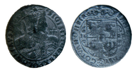
Fig. 12. An ort (1/4 thaler) of Sigismund III struck in Kraków, 1623. From the coin hoard of Tutrakantsi.

- 127 three groschen, 9 six groschen, 29 <sup>1</sup>/<sub>4</sub> thalers.<sup>14</sup> Unfortunately, the hoard was published more than 30 years ago, there are no photos of most of the coins and some mistakes in their identification might have been made. Only one specimen has a photo, but the coin is in very bad condition. From the description of the coins it could be concluded that most of them were struck in Polish mints, in Poznań, Kraków, Olkusz, Bydgoszcz, etc. In addition, coins of Lithuania and Gdańsk are presented. I would like to mention that the coin hoard of Dabravino definitely deserves further research.