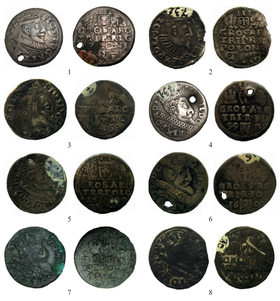
Figs. 1–8. Coins from the depository of the Museum of History in the town of Provadia. 1. Three groshen of Sigismund III from Poznań, 1591; 2. Three groshen of Sigismund III from Bydgoszcz, 1596; 3. Three groshen of Sigismund III from Bydgoszcz, 1598; 4. Three groshen of Sigismund III from Bydgoszcz, 1599; 5. Three groshen of Sigismund III from Olkusz, 1600; 6. Three groshen of Sigismund III, 1600; 7. A counterfeit of three groshen of Sigismund III; 8. A counterfeit of three groshen of Sigismund III.

Two specimens among the coins presented in this paper are very interesting. They are distinguished with schematics, incorrect inscriptions, and also struck on a copper core. All these characteristics indicate counterfeit. Similar specimens are known from other regions in Europe. Different issues of Sigismund III — three groschen, six groschen (szóstak), thalers, etc. were objects of counterfeit.<sup>12</sup>