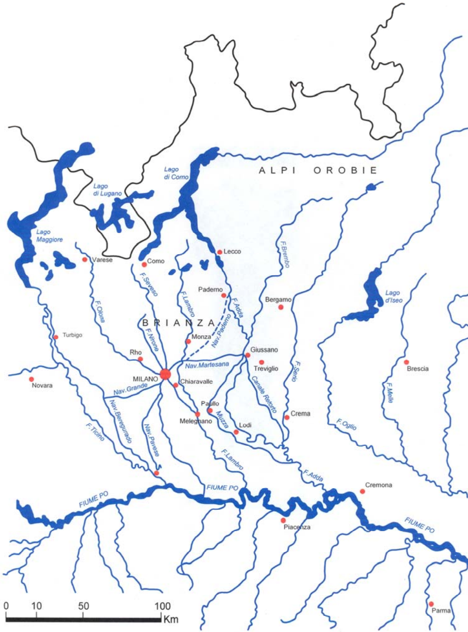
Fig. 2. Rivers and canals in Lombardy