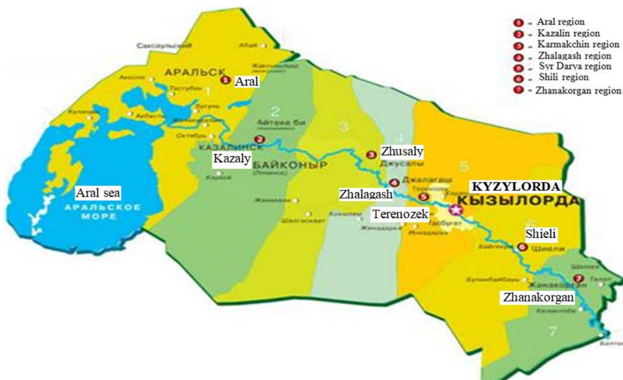
Fig. 1. Administrative map of Kyzylorda region of the Republic of Kazakhstan