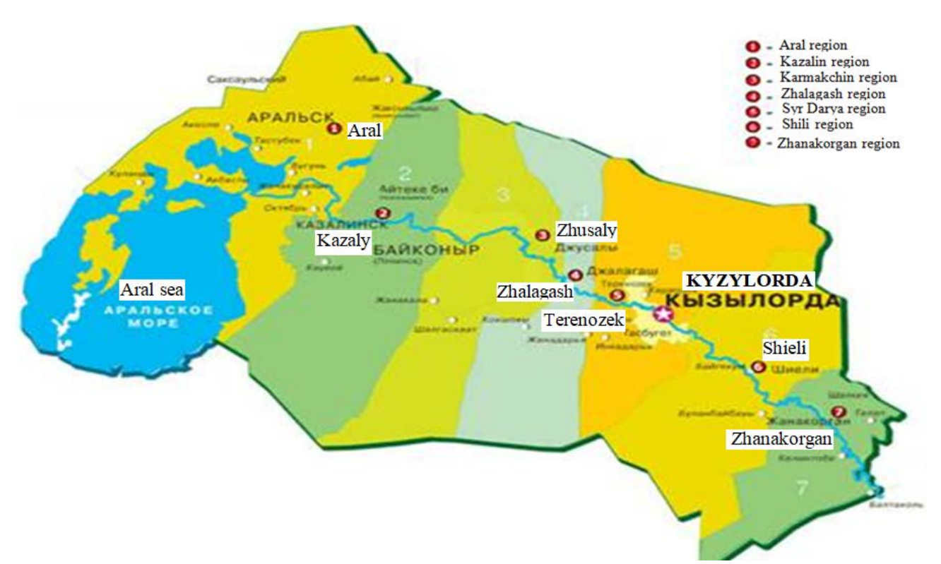
Fig. 1. Administrative map of Kyzylorda region of the Republic of Kazakhstan; source: own elaboration