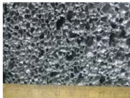
Fig. 2. Manufactured cast composite foam – macro view