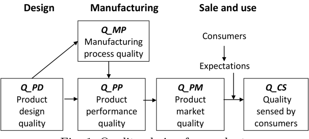
Fig. 1. Quality chain of a product.

The goal of this paper is to present the author's point of view on the potential contribution of quality engineering to sustainable development. It was assumed that quality engineering is oriented on implementation and creative development of the achievements and methods of various scientific disciplines in the design of products, their production, delivery and operation, with the intention of making these products best meet the needs and expectations of consumers, and to ensure their fair profit for producers and suppliers. In order to more clearly notice the tasks of quality engineering that could support sustainable economic development, and then define these tasks more closely, the process of creating quality in subsequent stages of a product's life has been analysed, Fig. 1 [10].