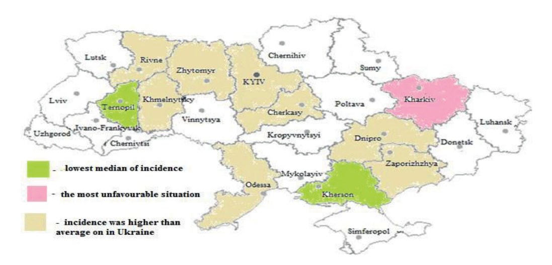
Fig. 1. Regions of Ukraine with the highest and lowest incidence of salmonellosis.

The incidence of salmonellosis was substantially different in various regions of Ukraine. The most unfavourable situation was in one of densely populated, industrially developed oblasts — Kharkiv oblast, where median salmonellosis incidence in 2011–2018 was 53.3 per 100 thousand people. The incidence of salmonellosis was also higher than average one in Ukraine (Fig. 1).