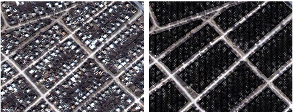
Fig. 1. Examples of the formation of territories with a clear and without a clear border: a) territories of forests and other wooded areas, b) territories under residential one- and two-story buildings