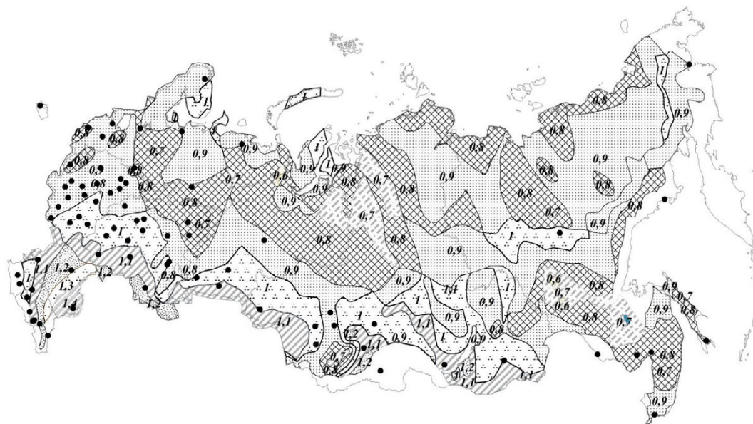
Fig. 2. In situ parameters of wastewater; TDS = total dissolved solids; source: own study

Map-scheme (Fig. 2) of spatial visualisation is built, the climatic coefficient \mu unifying the results from values of temperature and precipitation (built on the basis of data from 516 stations in period 1985–2015) where different hatch patterns in Figure 2 indicating the value (0.7; 0.8; 0.9; 1.0; 1.1; 1.2; 1.3; 1.4), the boundaries corresponding to a specific (calculated) climatic coefficient \mu are specified [DREGULO 2019].