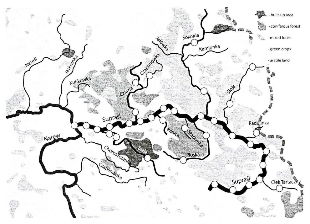
Fig. 1. The map of sampling points in the Supraśl catchment