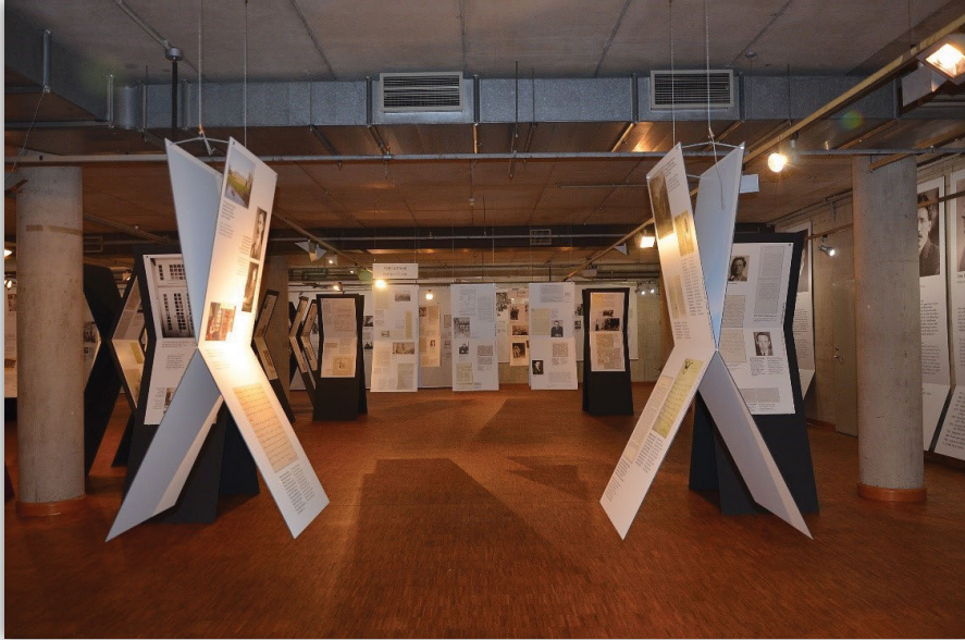
Exhibition in Warsaw

cious impact of political fanaticism and antisemitism and the struggle against exact thinking that was taking place at the time. The question of what international impact the Circle had was also addressed. Indeed, it influenced the Lvov-Warsaw School. However, there was also a Prague connection.