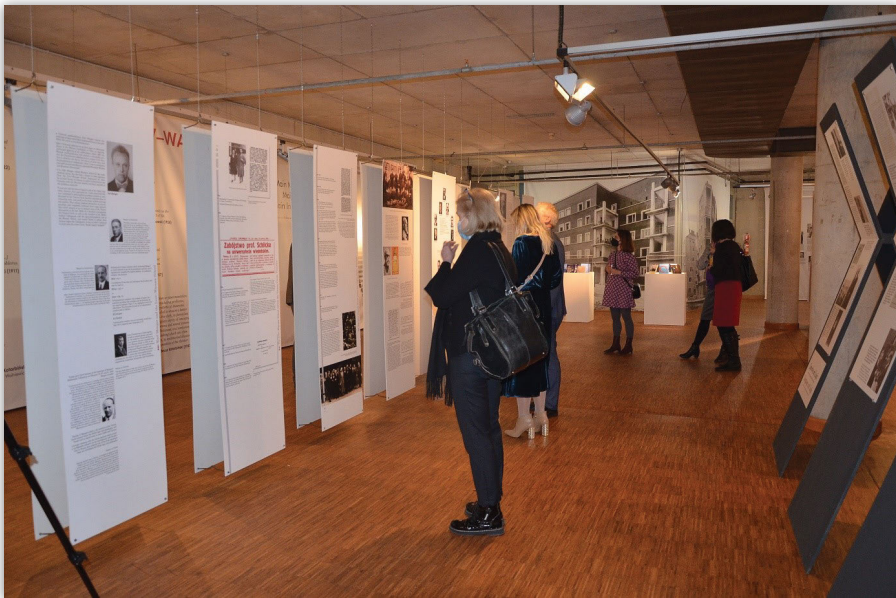
Audience visiting the exhibition in the University of Warsaw Library