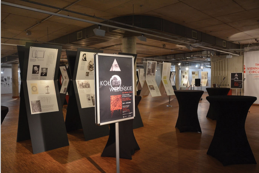
Exhibition in Warsaw

by one of his former students. The Vienna Circle had dissolved before the Nazis took over, and it never managed to regain popularity in Vienna after the war. However, it continued to exert a decisive influence on intellectual and scientific history of the 20th century.