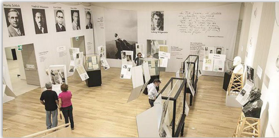
Exhibition in Vienna