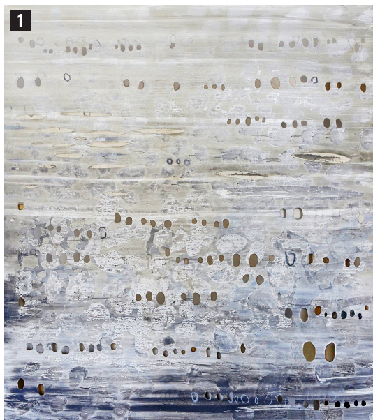
Fig. 1 Ebbing Tide Anima Mundi , 2017, 140×160 cm, mixed media