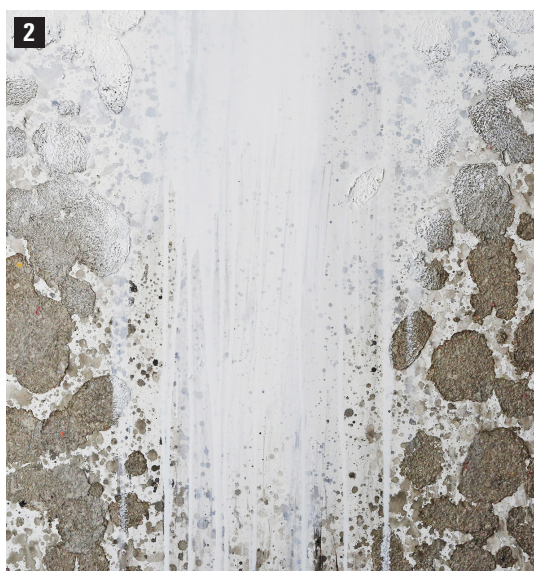
Fig. 2 White Waterfall , 2018, 120×140 cm, mixed media