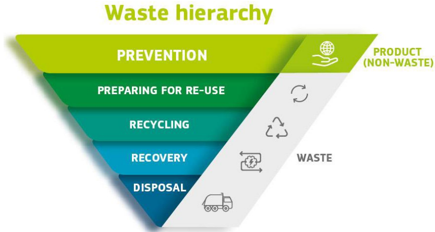
Fig. 1. Hierarchy of waste management in EU countries (Waste Framework Directive)

There is a clear hierarchy of waste management in EU countries (Fig. 1). The highest priority is the prevention of waste generation, the least desirable is disposal.