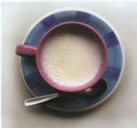
Colloid particles occur in nature, for example in milk