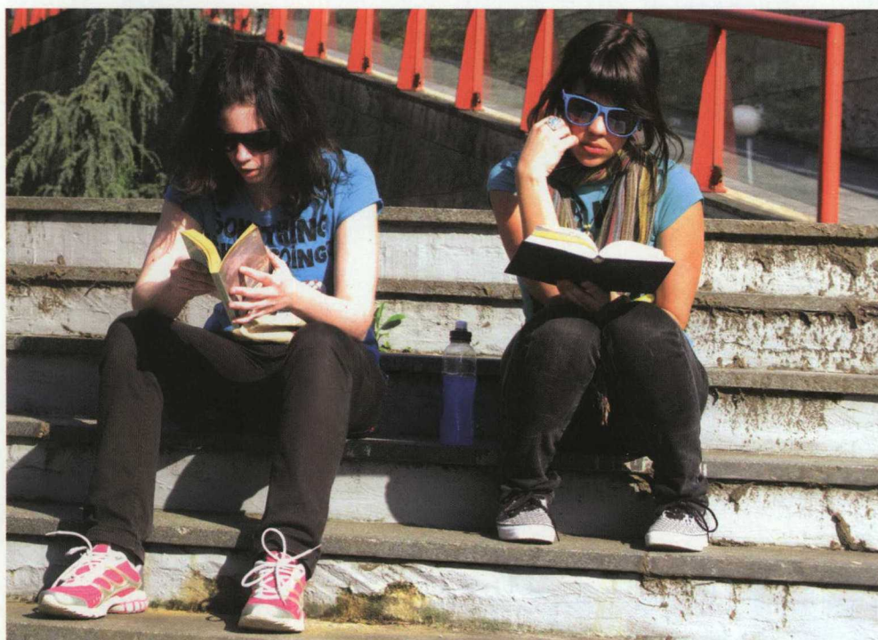
Sanja Gjenero, www.sac.hu

The cellular and molecular phenomena which underlie addiction are now known to be closely linked to the cellular mechanisms characterizing the learning process