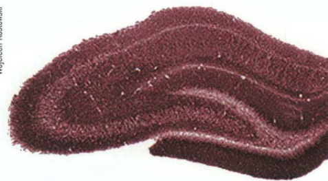
The hippocampus is the brain structure responsible for learning and memory processes