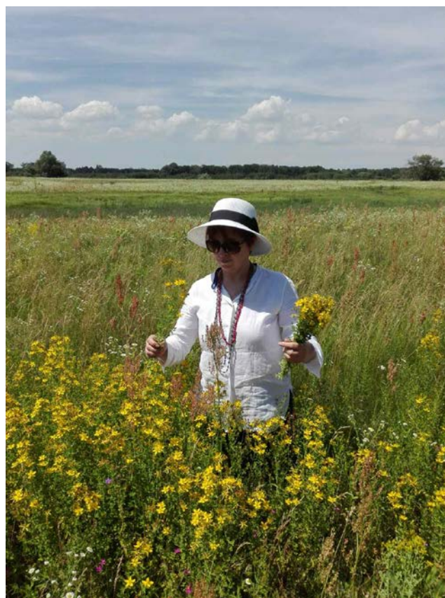
Fig. 3. Laying Hypericum perforatum in the Shestovytsia locality.

Among medicinal plants in the Chernihiv Polesie Chelidonium majus has the largest reserves. As a medicinal herb, celandine is equated to ginseng in the number of medicinal properties. It is one of the few plants whose antitumor effect has been proven by science. It delays development of even malignant tumors and effectively kills bacteria that cause tuberculosis. It has a diuretic, anti-inflammatory, choleric, analgesic effect. It relieves spasms, cramps and inhibits the activity of pathogenic microorganisms, acts as a mild laxative. It requires careful use due to high activity and toxicity. The healing properties of Chelidonium majus are known to 100% of the respondents in all four localities and are used to treat skin diseases – remove warts, calluses, scabies, eczema and psoriasis. In the Sedniv locality the people's heal-