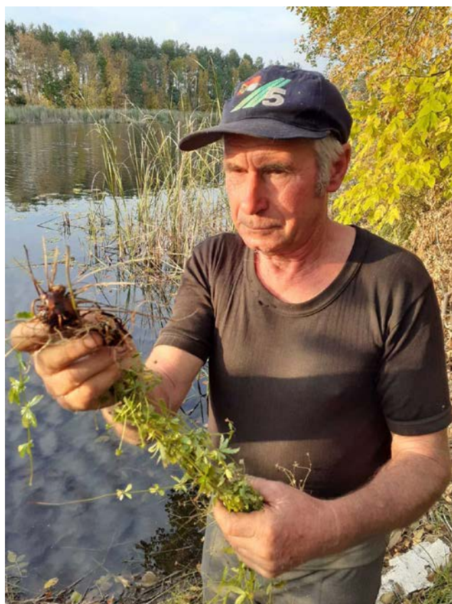
Fig. 4. A historian and botanist Volodymyr Popruha is laying the rhizomes of Potentilla erecta in (Liubech locality).

ing properties of Althaea officinalis (anti-inflammatory, enveloping and expectorant) and Gratiola officinalis (cardiotonic action). The local population in no locality lays medicinal plants in for profit.