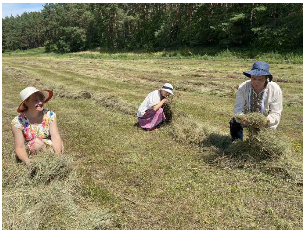
Fig. 5. The visual assessment of the hay quality in the Shestovytsia locality.

hornbeam firewood. The firewood of the deciduous species with hard wood ( Quercus robur , Betula pendula , Carpinus betulus , Robinia pseudoacacia ) provides a stable operating temperature in the furnace and a high specific heat value. Due to a low density of the soft wood ( Tilia cordata , Acer platanooides , Populus tremula , Salix fragilis ), a firewood burns quickly, does not form coal, but has a low specific heat value. 100% of the local population of the historical localities of the Chernihiv Polesie use firewood for heating. Sale of wood for building and firewood is carried out in the Tupyshiv and Liubech localities.