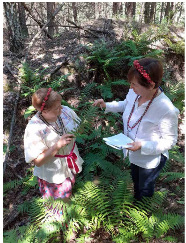
Fig. 8. The participants of the ethnobotanical expedition convincingly prove that there is no flower in Dryopteris filix-mas , which is traditionally searched for by women and girls (Sedniv locality).

On the night of July 6–7, Chernihiv Polesie celebrates the feast of Ivan Kupala, which symbolizes the worship of