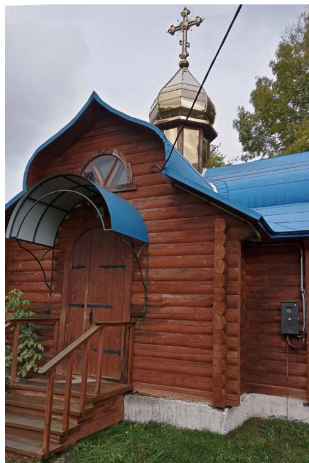
Fig. 6. The pine wooden church (Tupyshiv locality).

In the Chernihiv Polesie, a wickerwork has rich and ancient traditions and peculiarities. In contrast to the forest-steppe part of the Chernihiv region, where wicking from rye or wheat straw was widespread, in the Chernihiv Polesie willow, the bark of young linden (lyko) and birch (birch-bark, bast), coniferous and oak liber, the roots of fir, pine, etc. were used as raw materials for wicking household goods. People bent boxes for sowing and so on of shingles – thin plywood-like boards, which were chipped from thick logs, carefully planed and steamed in the oven. The modern local population of all the historical localities of the Chernihiv Polesie most often uses baskets made of Salix viminalis , less often – of other species of willows ( Salix ). The significant resources of this shrub in the Liubech and Sedniv localities allow people to use the plant not only for their own needs, but sometimes for profit. In recent decades, the demand for wicker products has grown significantly. The baskets are used for various purposes, including the yielding and storage of roots, bulbs, tubers, vegetables, fruits, grass, hay, as well as to gather mushrooms. Each