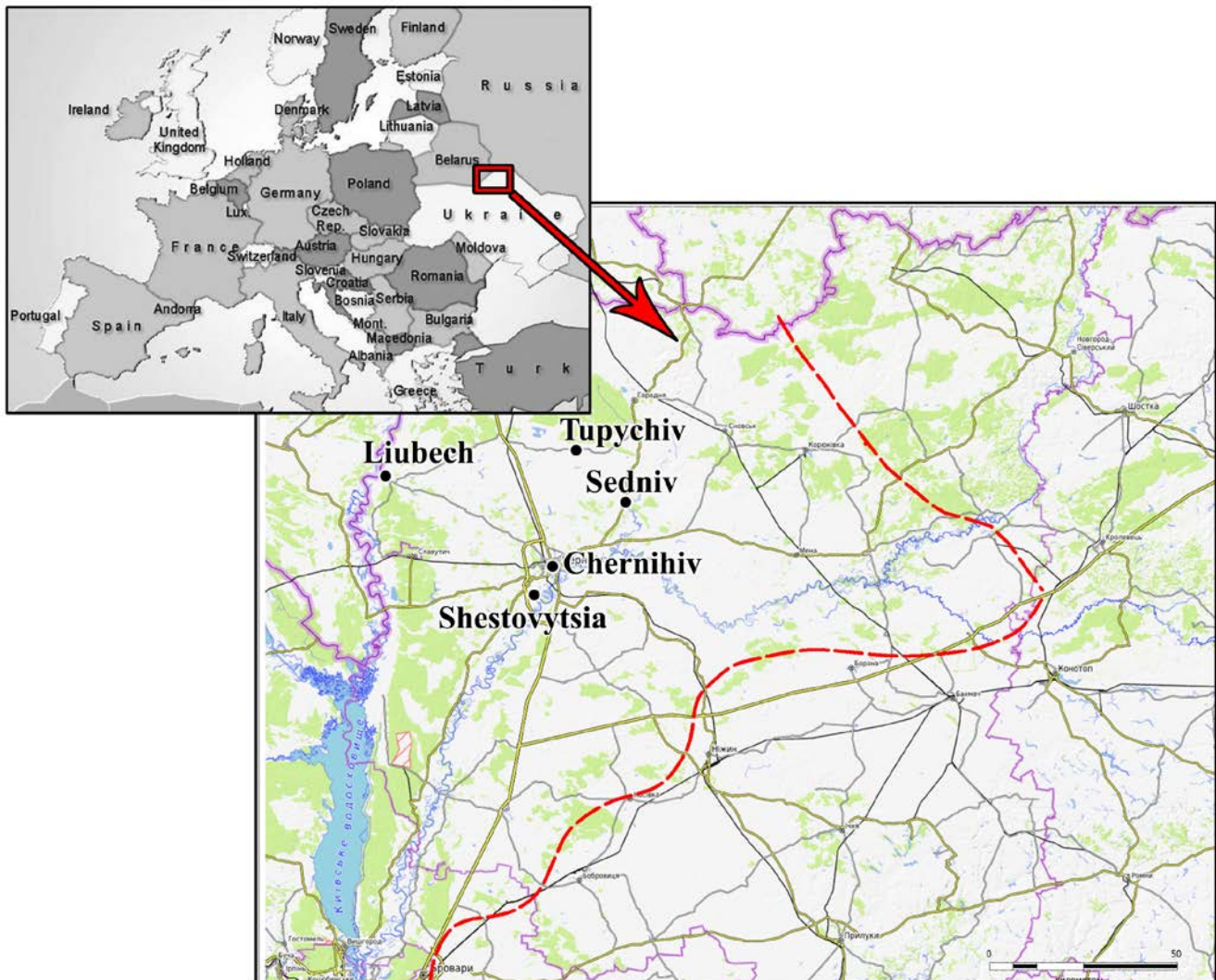
Fig. 1. The historical localities of the Chernihiv Polesie.

The Liubech locality is situated on the left pine terrace of the Dnipro River, 60 km northwest of Chernihiv. The Slavic settlements in the area existed in the first centuries of our era. The first mention of Liubech, which is among the oldest cities on the Dnipro, dates back to 882 AD (Kudrytskyi, 1990). The Liubech locality includes the villages: Korobky