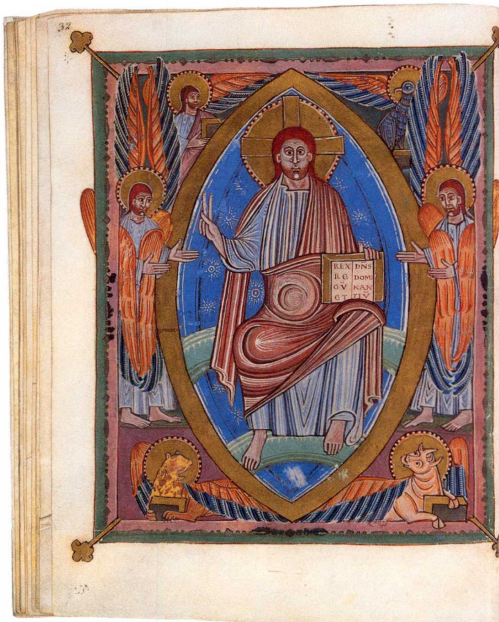
Polish National Library

Other prophets follow Amos in predicting the coming of the Day of the Lord, and with it the advent of the Divine Kingdom on earth. For them, this represents the consummation of the plans of God in the Highest, himself slowly and gradually bringing them to fruition in human history. But at the turn the 3 rd