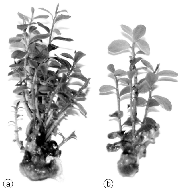
Fig. 2. Shoot proliferation of cv. Koralle on Anderson's medium with 0.5 mg l -1 zeatin at medium pH 5.5 (a) and pH 4.0 (b).