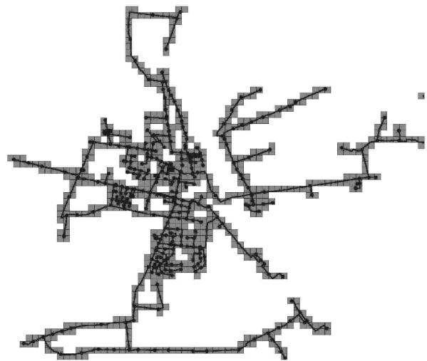
Fig. 2. Image of the examined network depending on the length of covering square \delta = 1/15 (on the left) and \delta = 1/65 (on the right) of the longest horizontal dimension of the examined network

vation method presented in Fig. 2, topological dimension of the examined set was calculated as well. To that end, the box-counting method [23, 24] developed on the basis of works by Kołmogorow and Minkowski was used. The unknown dimension was calculated using the formula: