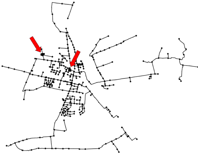
Fig. 1. Geometrical structure of the examined water supply network. Arrows indicate locations of water pumping stations

metrical structure of the network is presented in Fig. 1. It is a mixed network, containing 14 rings and multiple branches. It is composed of 356 nodes and 639 pipes.