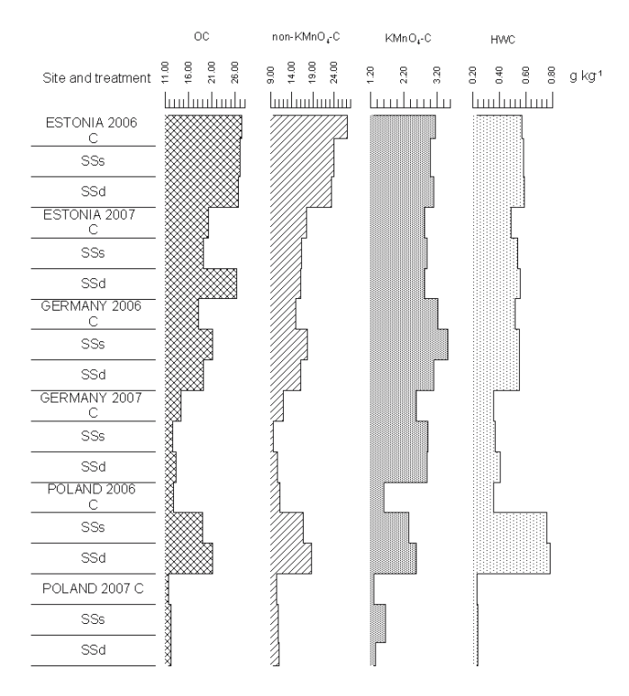
Fig. 1. Labile and non-labile organic carbon fractions in the soils studied

The content of organic carbon in the studied soil samples increased after application of sewage sludge in the first year in Germany and Poland. In Estonia, the amount of OC in control and amended plots was similar (Fig. 1). Nevertheless, it should be noted that organic carbon decreased by 20–30% in the second year after application of sewage sludge and the decrease affected also control soil samples.