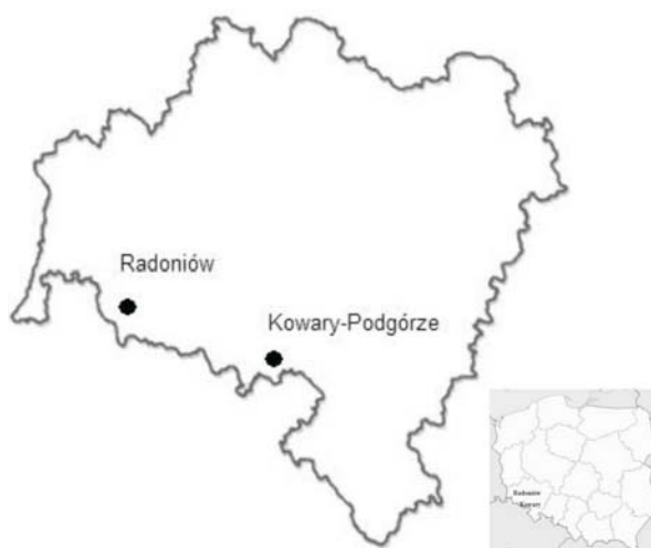
Fig. 1. Map of Lower Silesia and sampling sites

Rys. 1. Mapa Dolnego Śląska z zaznaczonymi miejscami poboru próbek