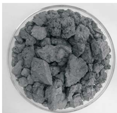
Fig. 4. Sample taken from heap 16 in Kowary – Podgórze

Rys. 3. Próbką pobrana z hałdy w Radoniowie