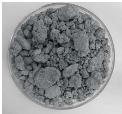
Fig. 3. Sample taken from the heap in Radoniów

Fig. 2. Próbką pobrana z hałdy 19 i 19a w Kowarach – Podgórzu