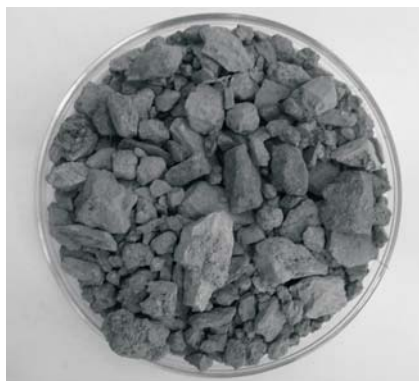
Fig. 2. Sample taken from heap 19 and 19a in Kowary – Podgórze

Fig. 2. Próbką pobrana z hałdy 19 i 19a w Kowarach – Podgórzu