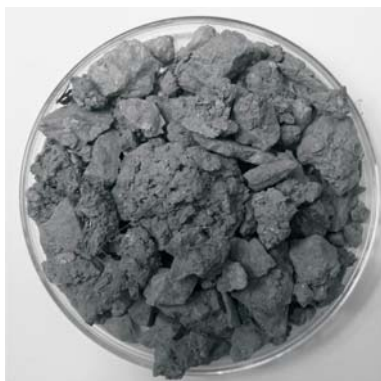
Fig. 5. Sample taken from heap 17 in Kowary – Podgórze