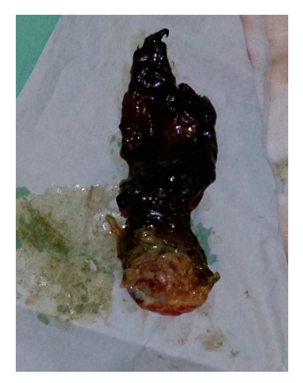
Fig. 3. Necrotic rectum.