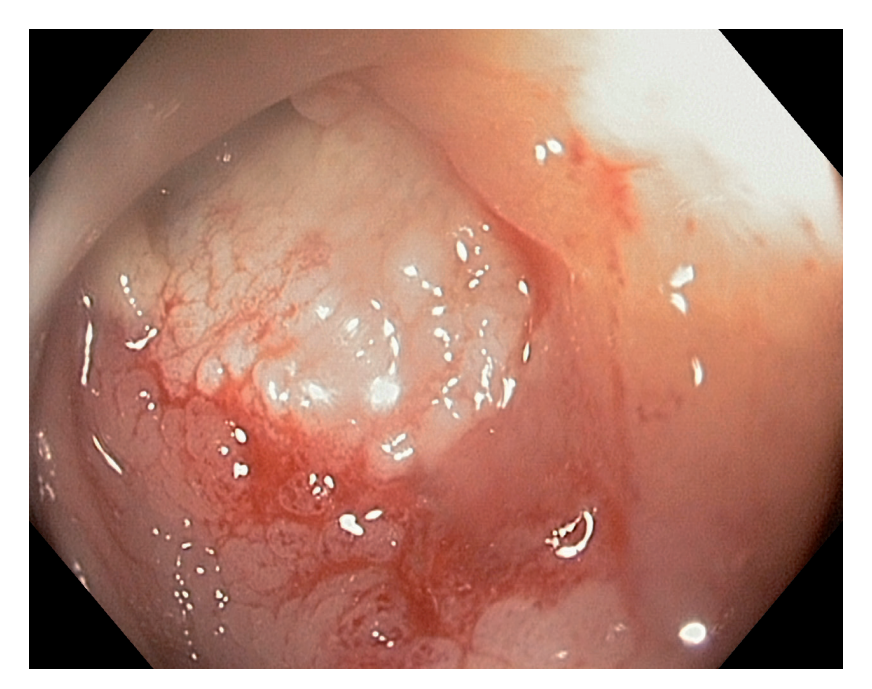
Fig. 1. Cylindrical infiltration with ulceration.