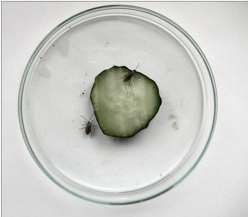
Fig. 1. Male and female of D. virgifera on Petri dish

In the study years copulating beetle pairs of D. virgifera collected from the maize plants were kept on 9 cm diameter Petri dishes. There was 1 pair of beetles on each Petri dish (Fig. 1).