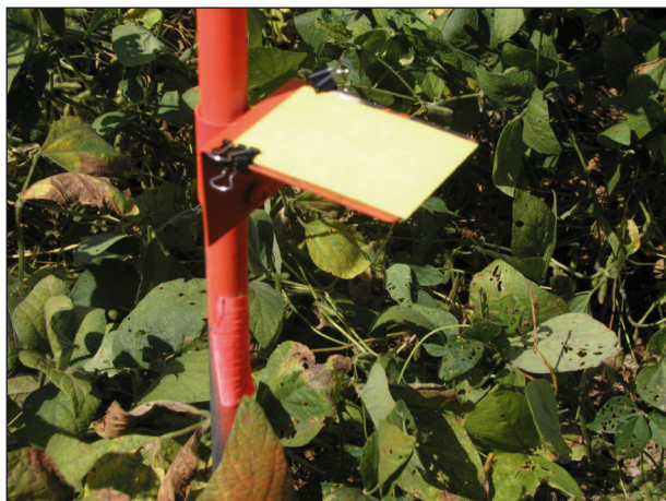
Fig. 1. Water sensitive paper cards at top of canopy