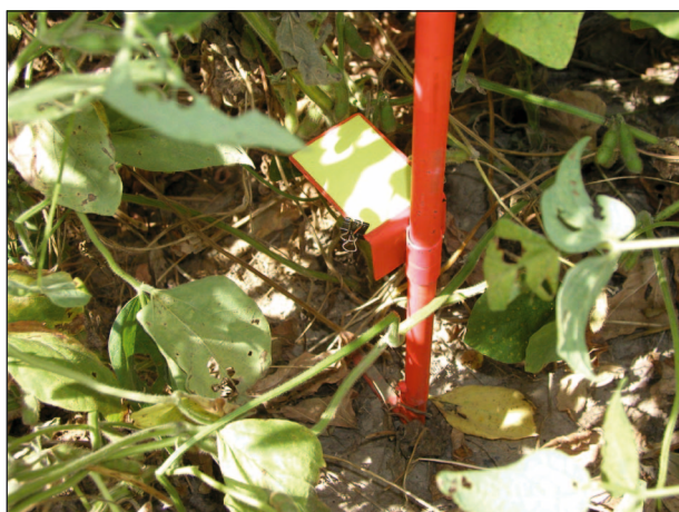
Fig. 2. Water sensitive paper cards at bottom of canopy

booms for each run. As it took about ½ hour to change booms and verify nozzle flow and proper operation, this was not practical. A modified plan was implemented by which the booms (nozzles) were changed every six runs, but their sequence was randomised. Direction of flight and spray release height were then randomised within the boom spraying the crop. The time of the field entry for each run was noted to-the-second using an atomic watch.