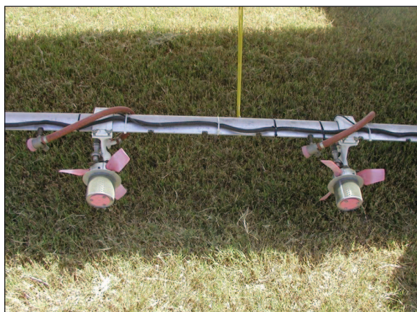
Fig. 3. CP®-09 and Accu-Flo® spray nozzles; Micronair® AU5000 rotary atomiser on spray booms